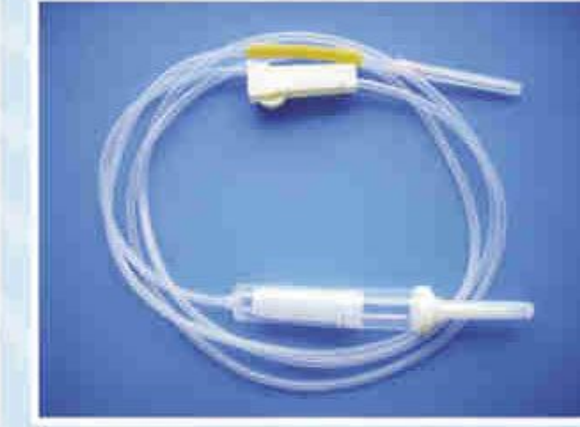
Blood Transfusion Set